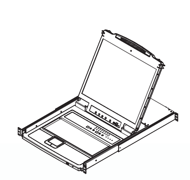
B020-U16-19-IP 1U Rack Console with 16-Port KVM Switch and Remote Access