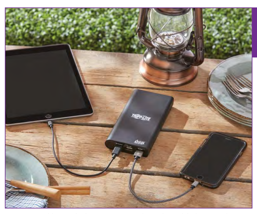
Tripp Lite's portable power banks are a convenient solution when mobile devices need on-the-move charging.