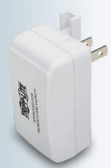
Compact size is easy to tote and plugs into tight spaces

Tripp Lite's U280-001-W2-HG is the first medical-grade USB wall charger certified safe for patient-care vicinities. This new solution is compliant with UL 60601-1 standards, making it currently the only USB charger on the market safe for use in all areas of a hospital, clinic or other medical facility.